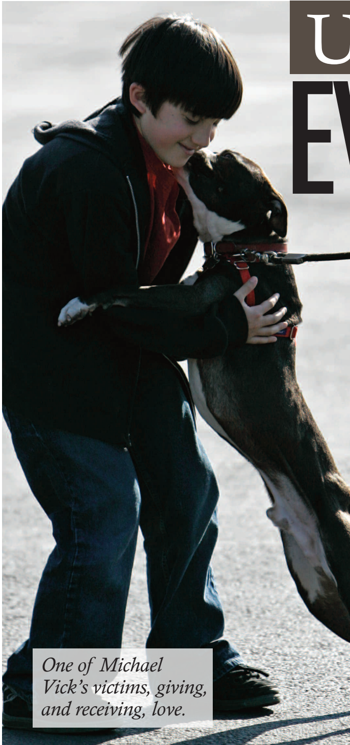
One of Michael Vick's victims, giving, and receiving, love.

Depending on the severity of the condition, there may also be a need for behavioral rehabilitation protocols and even drug therapy. In extreme cases, where the animal is tormented or, in the case of a dog who poses a direct and immediate risk to public safety, there may be a need for a sanctuary environment.